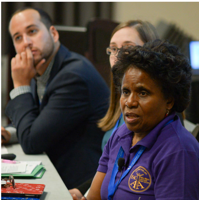
Community advocates and energy equity organizers gathered for PSE's first Just Energy Summit in 2016 at Atlanta Metropolitan State College in Atlanta, GA.