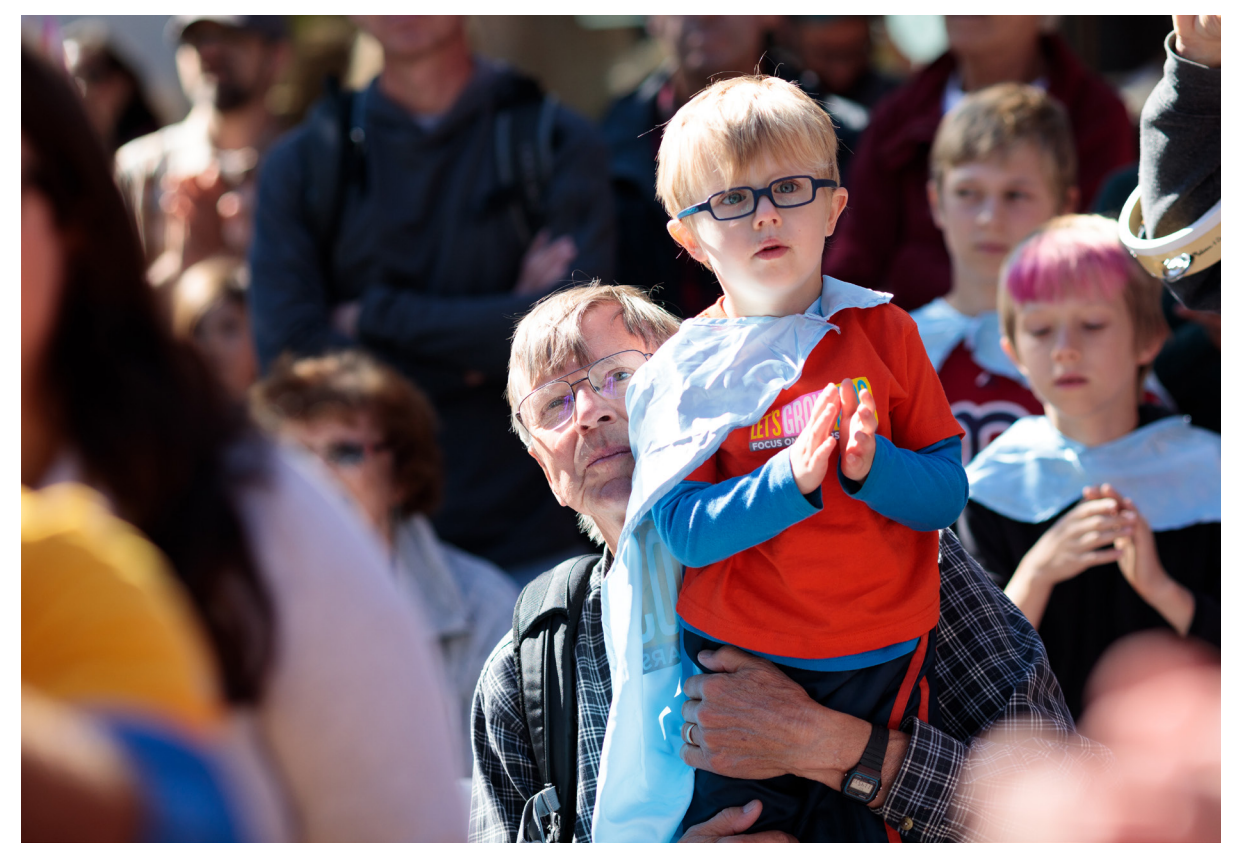
A father and son attend Let's Grow Kids' Kids Out Loud event in downtown Burlington, VT, to advocate for affordable access to high-quality childcare in the state.

Sometimes the vision for equitable population-level change is local. Let's Grow Kids is working to ensure affordable access to high-quality childcare for all Vermont families by 2025. The organization recognizes that achieving such a vision will require not only expanded equitable access, but fundamental shifts in the systems and structures that currently impede it. Their commitment to anti-racism manifests itself in an inclusive vision for high-quality early learning communities as well as in their commitment to centering the historically-marginalized voices of early childhood educators. Unsurprisingly, movement building and state-level policy change are core tools it employs to ensure the changes they achieve endure as embedded components of Vermont's governance. Alongside their legislative efforts, the intermediary is also working to strengthen the early childhood education ecosystem and position actors to lead and sustain changes won in 2025 and beyond. "We build capacity with community partners and slowly step back from the work so that they are self-sustaining," shares Let's Grow Kids CEO Aly Richards.