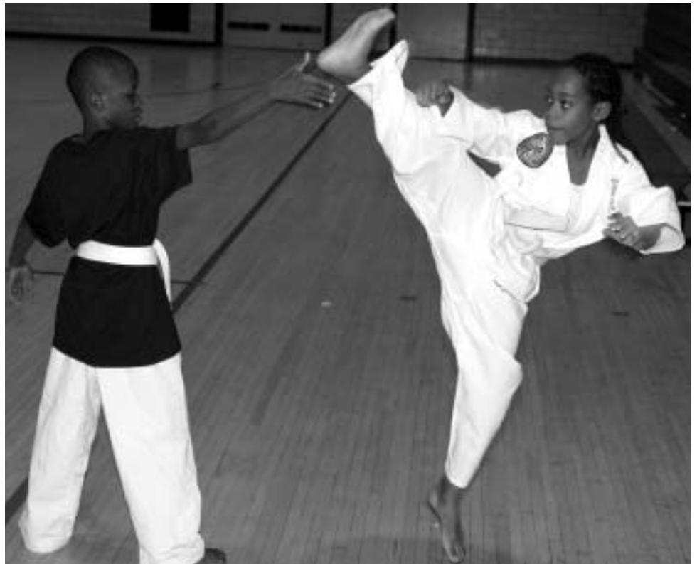
The Harlem Children’s Zone is dedicated to improving the lives of kids up to age 18 in central Harlem. Specifically HCZ seeks to put Harlem youths on an educational par with their middle-class peers.