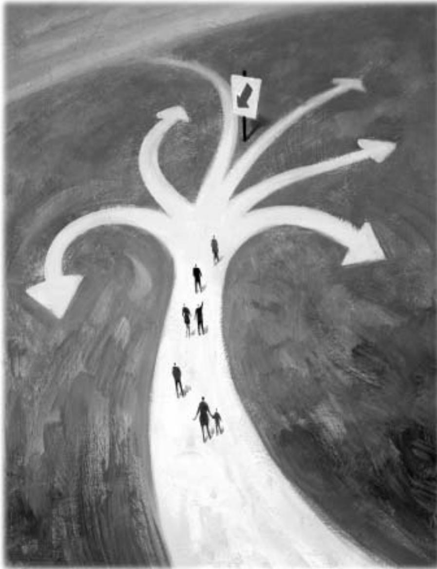
ILLUSTRATION BY ANDREW JUDD/MASTERFILE

Heroic efforts might help a handful of children escape from devastated neighborhoods like those of central Harlem. But saving the next generation would require a critical mass of adults versed in the techniques of effective parenting and engaged in common activities.