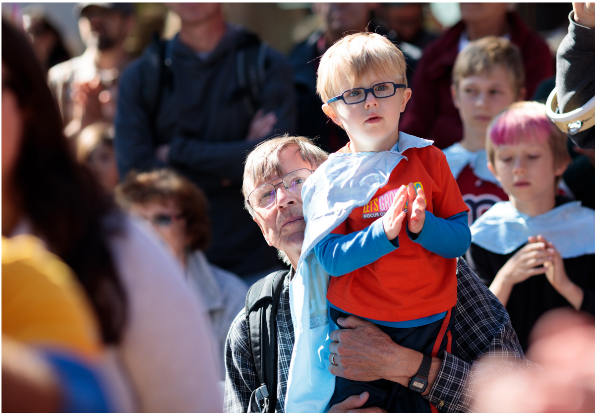
A father and son attend Let's Grow Kids' Kids Out Loud event in downtown Burlington, VT, to advocate for affordable access to high-quality childcare in the state.

Sometimes the vision for equitable population-level change is local. Let's Grow Kids is working to ensure affordable access to high-quality childcare for all Vermont families by 2025. The organization recognizes that achieving such a vision will require not only expanded equitable access, but fundamental shifts in the systems and structures that currently impede it. Their commitment to anti-racism manifests itself in an inclusive vision for high-quality early learning communities as well as in their commitment to centering the historically-marginalized voices of early childhood educators. Unsurprisingly, movement building and state-level policy change are core tools it employs to ensure the changes they achieve endure as embedded components of Vermont's governance. Alongside their legislative efforts, the intermediary is also working to strengthen the early childhood education ecosystem and position actors to lead and sustain changes won in 2025 and beyond. "We build capacity with community partners and slowly step back from the work so that they are self-sustaining," shares Let's Grow Kids CEO Aly Richards.