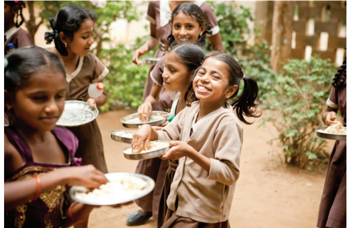
Students enjoy 12-cent lunches courtesy of Akshaya Patra.

Microfinance is the classic example of philanthropy stepping up to invest in intermediaries to accelerate the development of an entirely new field. It started out as a project run by non-profits and government agencies, and as early experiments proved successful, key innovators — backed by philanthropy — developed public data sources and third-party verification systems. Two innovations in particular — the first microfinance rating agency in 1999 and soon afterward, the launch of an authoritative data clearinghouse — gave mainstream investors easy access to the information they needed to make informed investment decisions. Over time, these intermediary organizations paved the way to attract for-profit capital markets into the microfinance arena.