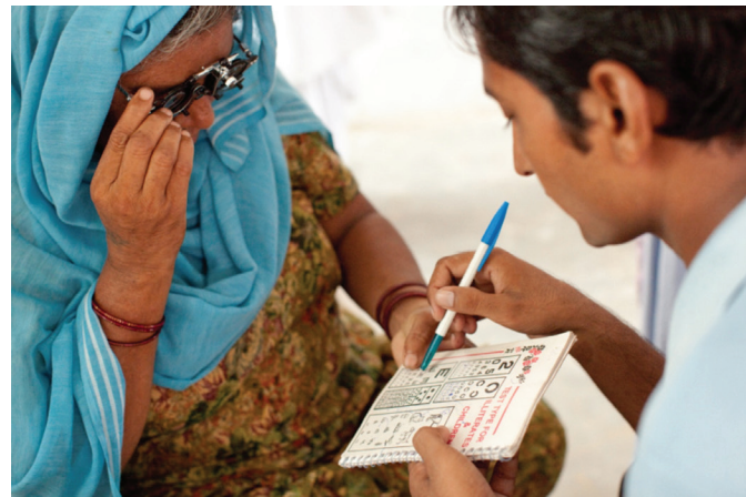
VisionSpring has developed a commercially-sustainable business model.

VisionSpring set out to create a commercially sustainable business model, Kassalow told Good magazine, because he be-